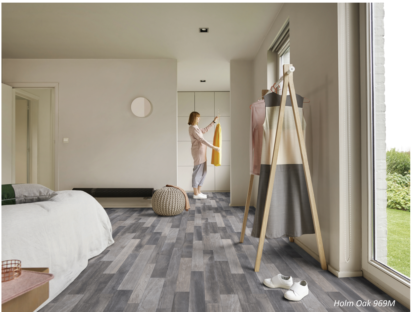
Holm Oak 969M