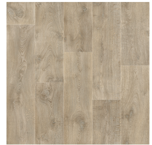
Texas Oak 630M