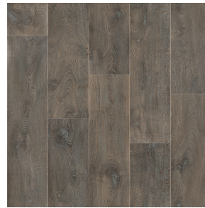
Texas Oak 620D