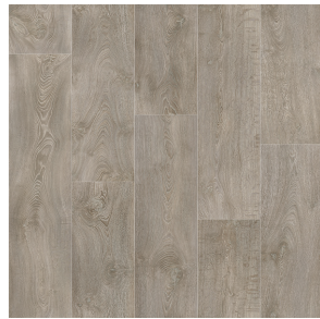
Texas Oak 603M