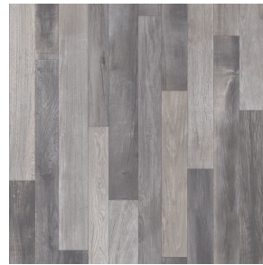
Holm Oak 969M