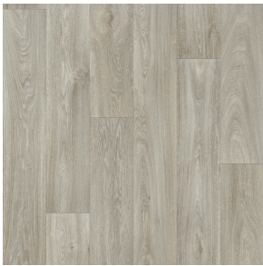
Havana Oak 019S