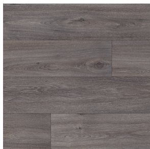
Havana Oak 966D