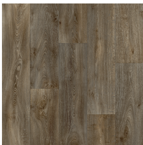
Texas Oak 693D