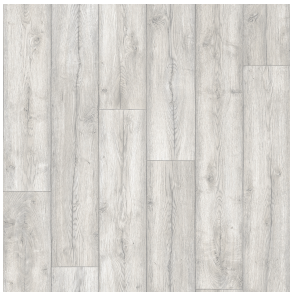
Antique Oak 091S