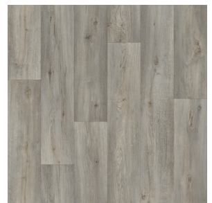
Silk Oak 979L