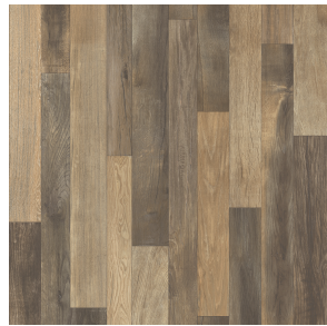
Holm Oak 619M