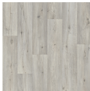
Silk Oak 916L