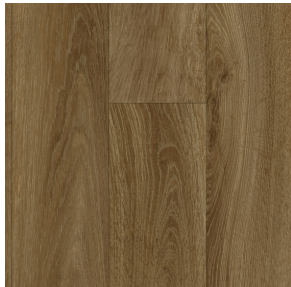
french oak warm brown