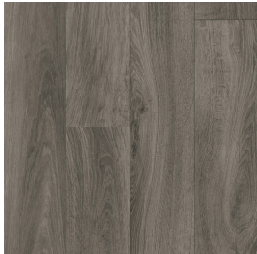
french oak anthracite