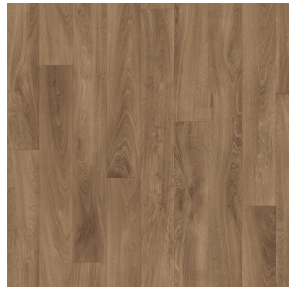
french oak light brown