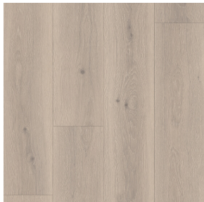
mill oak light grey