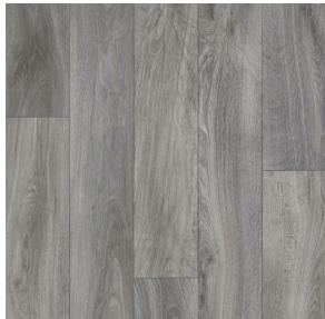
french oak smoke