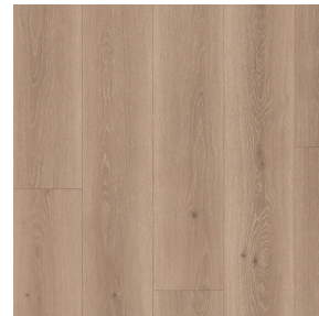
mill oak light brown