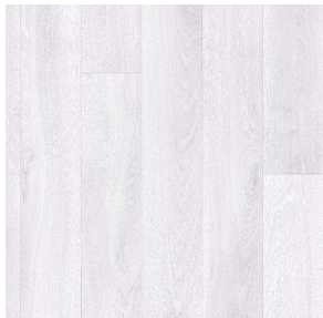
french oak snow