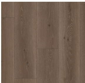
mill oak brown