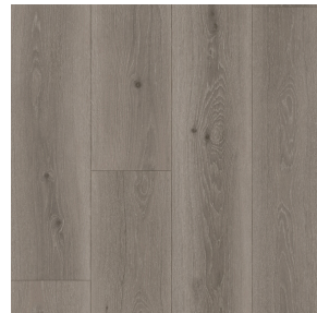
mill oak grey