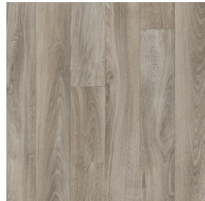
french oak grege