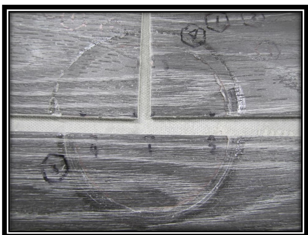
Recovered Swell (Disassembled)