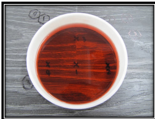
24 Hrs with Water