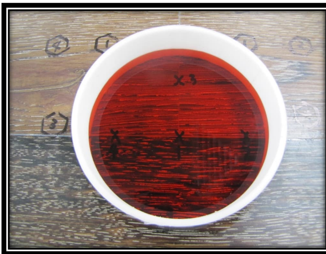
24 hrs With Water