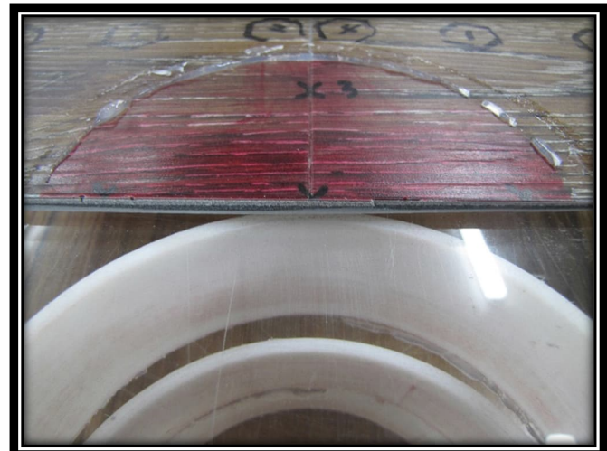
Recovered Swell (Disassembled)

"THIS REPORT APPLIES ONLY TO THE SAMPLES TESTED"