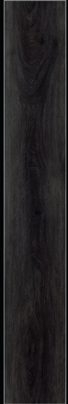
Sienna Oak 8396