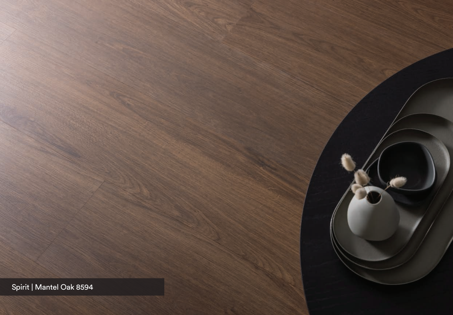
Spirit | Mantel Oak 8594