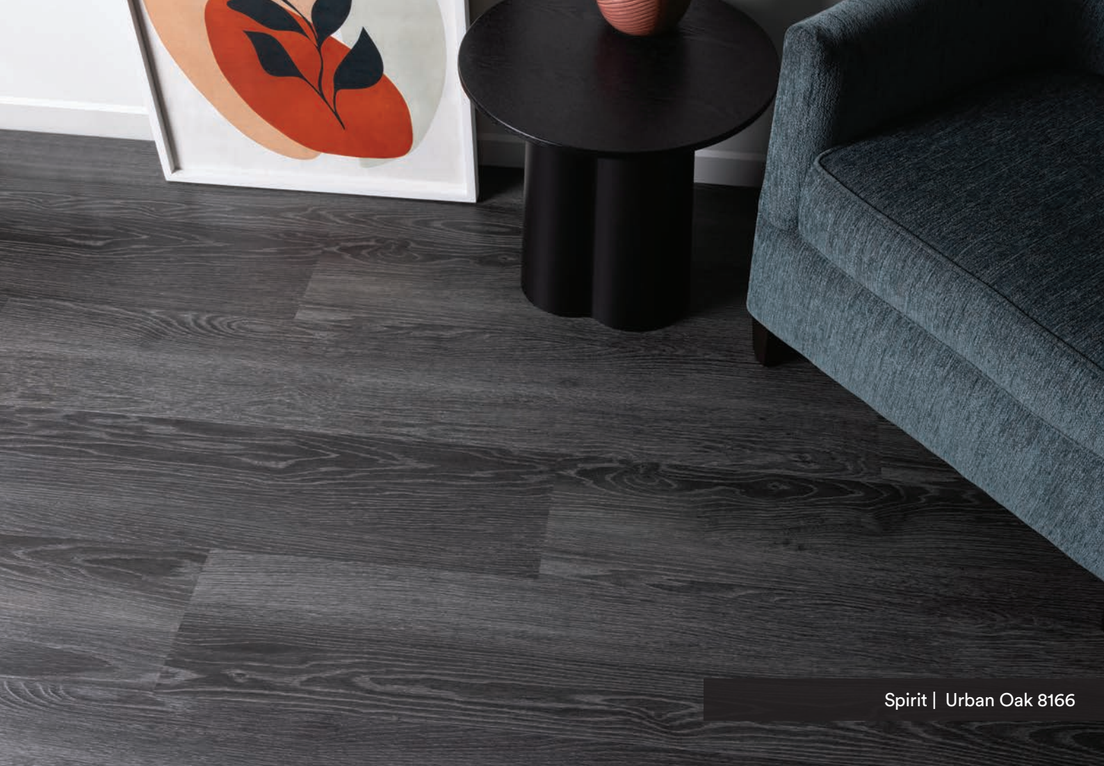
Spirit | Urban Oak 8166