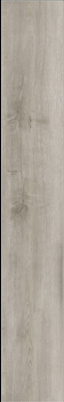
Vintage Steel 0143