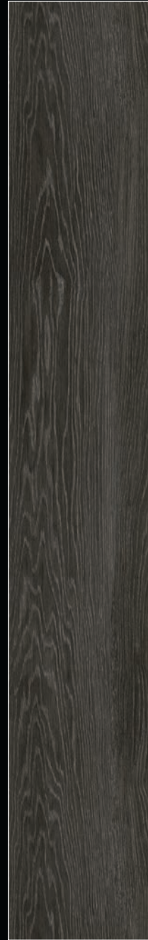
Urban Oak 8166