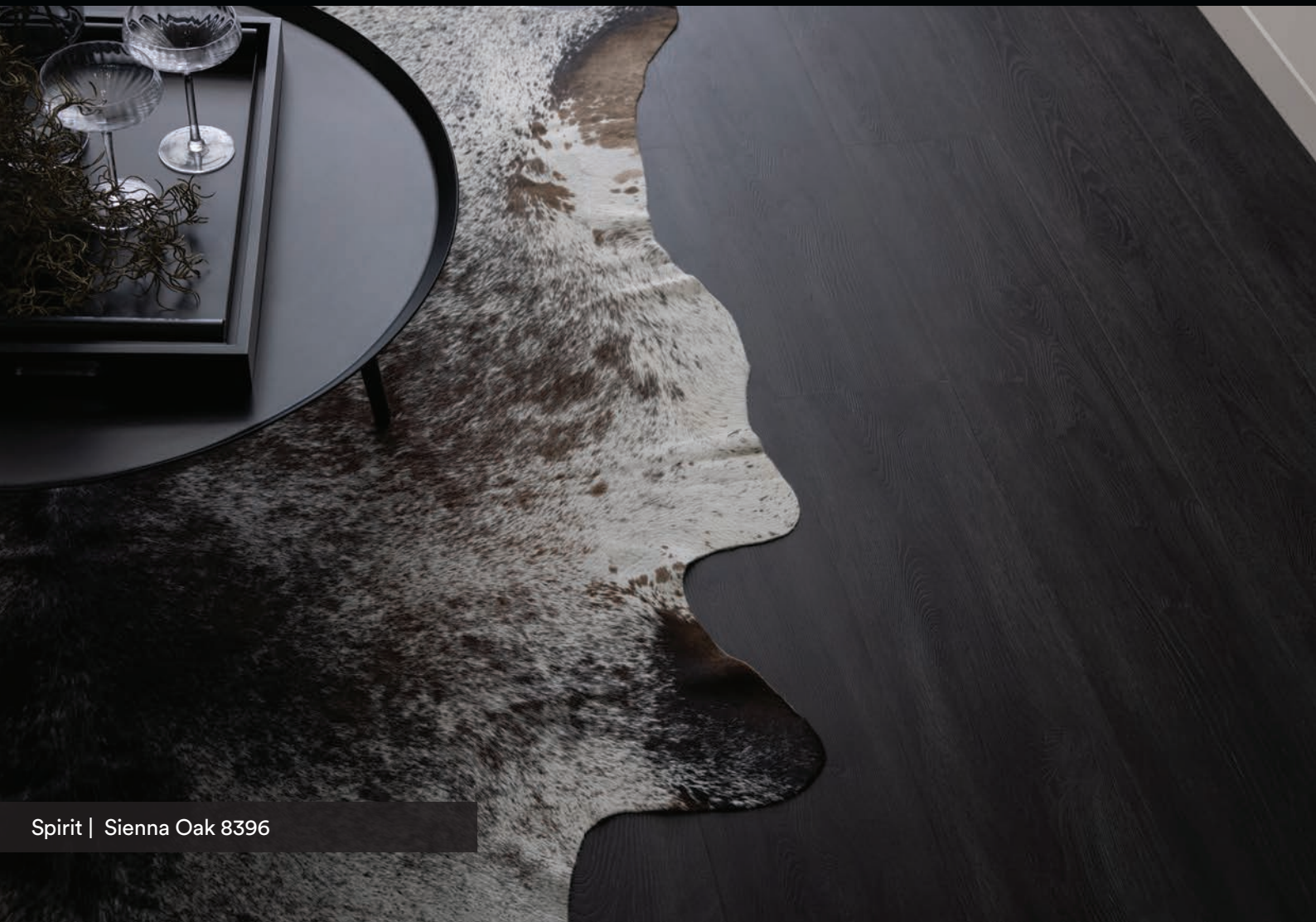
Spirit | Sienna Oak 8396