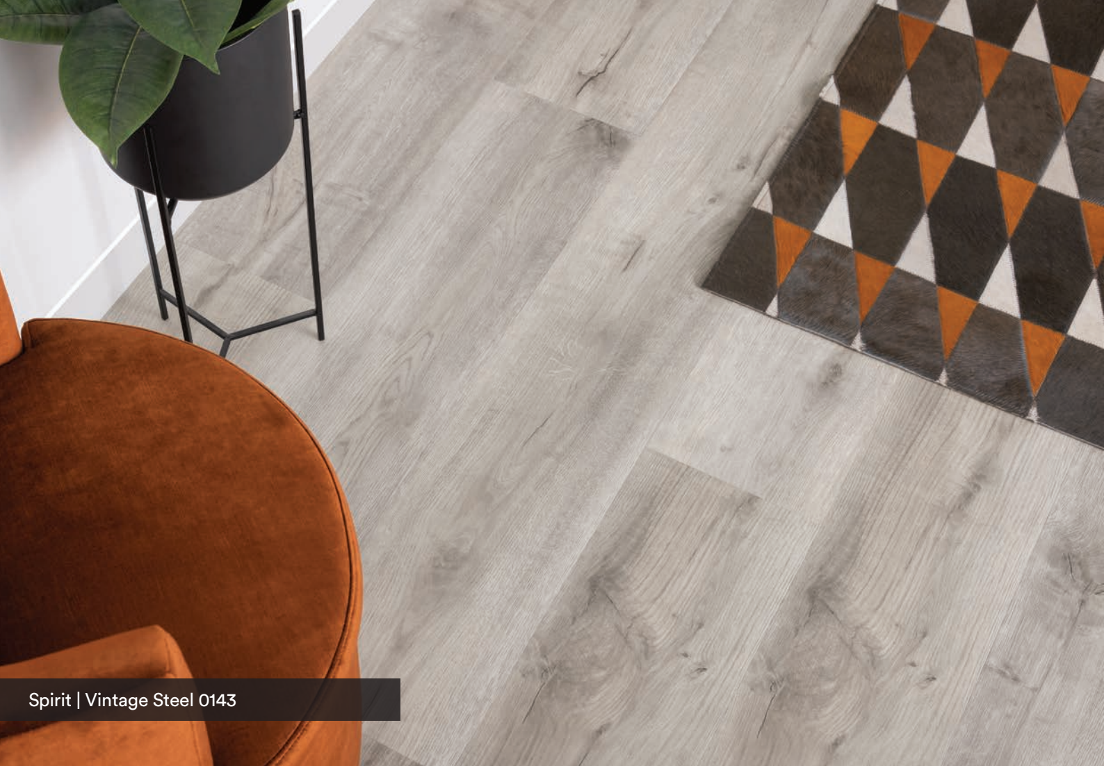
Spirit | Vintage Steel 0143