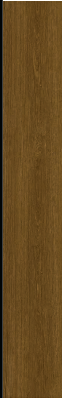
Mantel Oak 8594