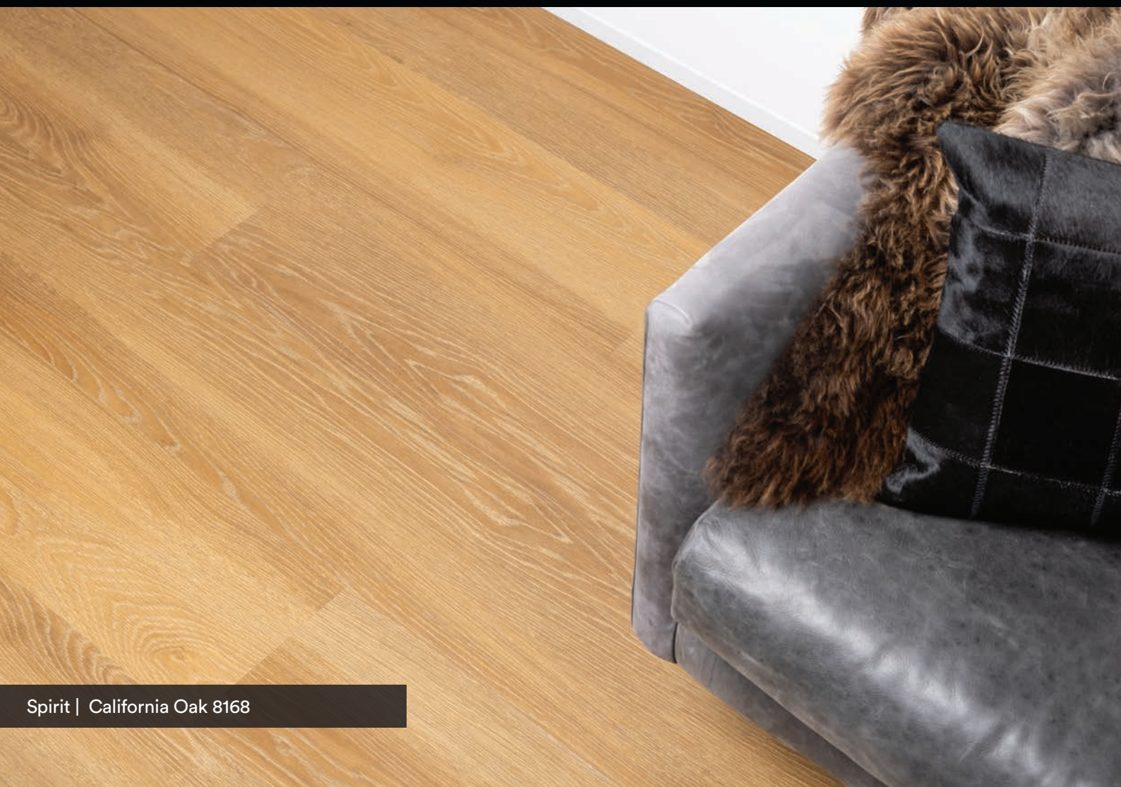
Spirit | California Oak 8168