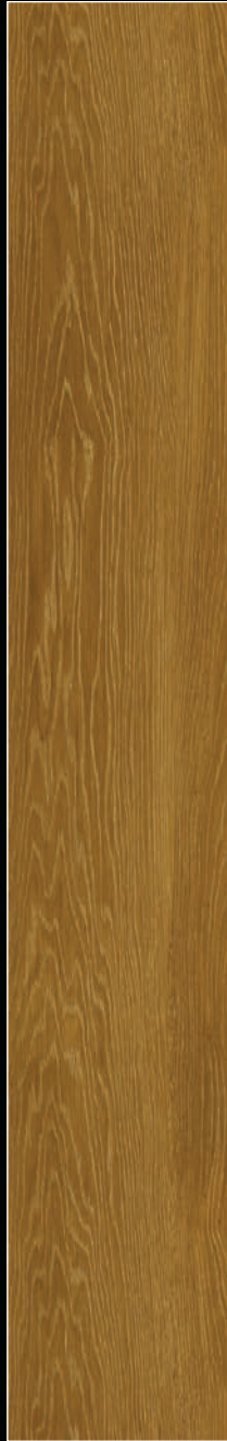
California Oak 8168