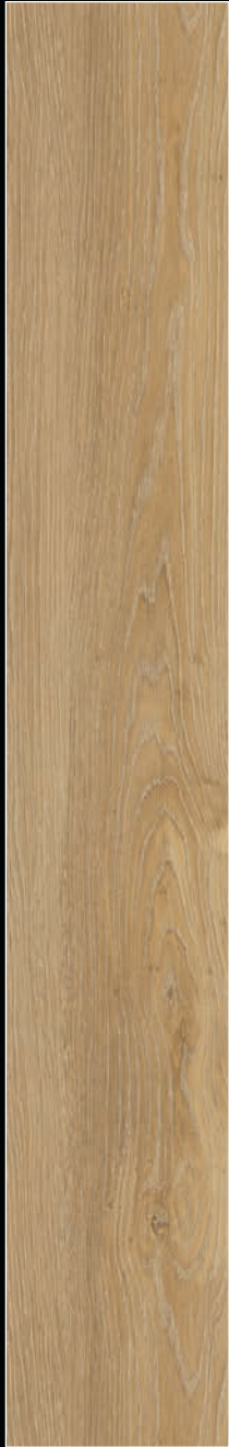
Cashmere Oak 6678